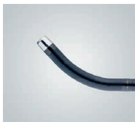
High durability for cost effectiveness