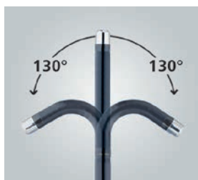
Precise motion for perfect control