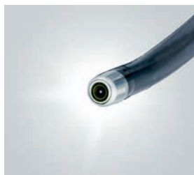
Outstanding optical quality for brilliant image