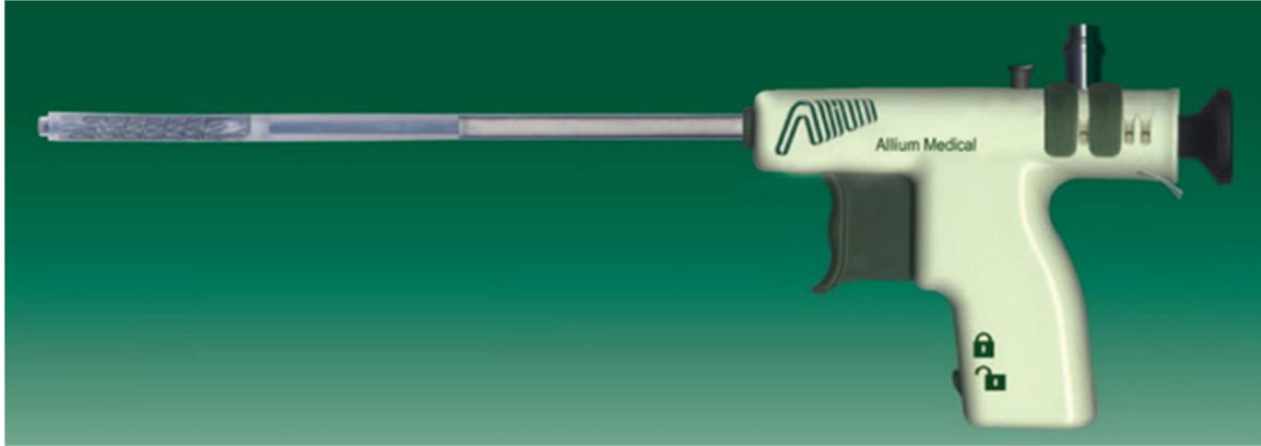
Figure 2. Gun-like delivery system of Allium BUS on which stent is mounted.