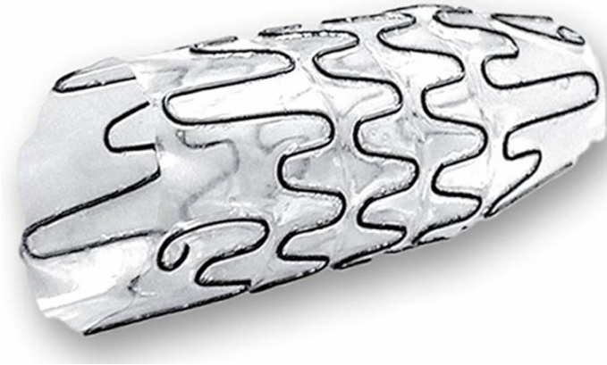
Figure 1. Specially designed Allium BUS; fully covered, self-expandable, large caliber metal stent.

All patients provided informed consent form and underwent urethral stent placement. Internal urethrotomy was performed prior to stent placement. Stricture length was documented, as well as stricture etiology and prior stricture treatment.