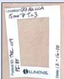
Axilla 15 months after three LightSheer Duet HS treatments

Are there other devices that use the same basic reduced-fluence principle?