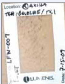
Axilla before Tx, baseline

Caucasian, skin type IV, brown hair Fluence: 9 – 10 J/cm 2 Pulse time: 47 – 100 ms Vacuum: Medium