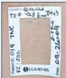
Axilla six months after three LightSheer Duet HS treatments