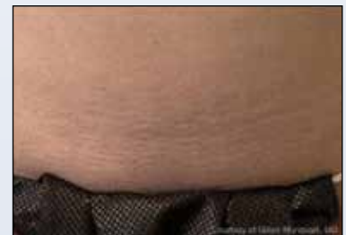
Lower abdomen six months after five LightSheer Duet HS treatments