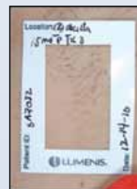
Axilla 15 months after three LightSheer Duet HS treatments