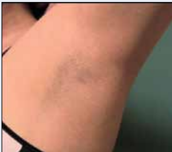
Axilla nine months after five LightSheer Duet HS treatments