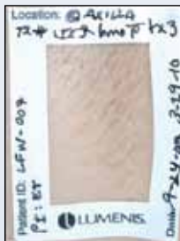
Axilla six months after three LightSheer Duet HS treatments