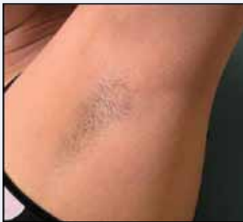
Axilla before Tx, baseline

What are the business advantages of a faster, more comfortable treatment if safety and efficacy are equal?