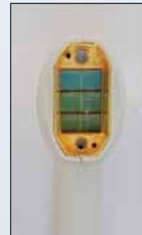
LightSheer Duet HS handpiece