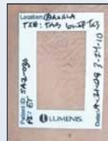
Axilla six months after three LightSheer Duet HS treatments