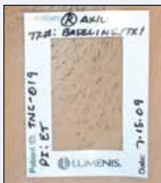
Axilla before Tx, baseline

Caucasian, skin type: IV, brown hair Fluence: 11 J/cm 2 Pulse time: 50 – 100 ms Vacuum: Medium