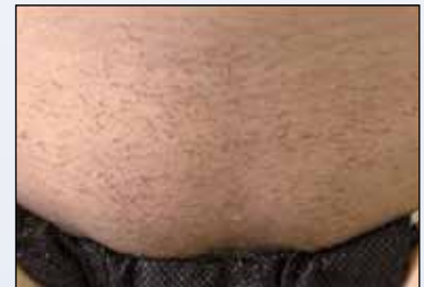
Lower abdomen before Tx, baseline

Dr. Halachmi – The HS handpiece is excellent for men because it can cover a large area, like the back or chest, very quickly. We are cautious about choosing male candidates for chest and back treatment. Good candidates are those who have very dark and very coarse hair. Men with fine hair or light hair will not respond well to any laser hair removal treatment.