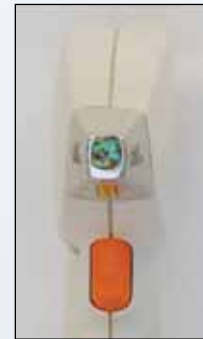
LightSheer Duet ET handpiece

Dr. Halachmi – Although traditional laser hair removal is effective and generally well tolerated, there are three aspects which can be improved: treatment speed, discomfort and risk of adverse events. The large spot size of the HS handpiece has significant advantages in all three areas. First and most simply, you can cover more area more quickly with a larger spot size. Secondly, the larger spot size allows better penetration of the laser energy – meaning that less energy needs to be applied at the surface to achieve therapeutic heating at the depth of the hair follicles. Lower fluence at the epidermis translates into less pain and lower risk of adverse events.