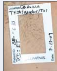
Axilla before Tx, baseline

Asian, skin type: III, brown hair Fluence: 11 J/cm 2 60 ms Vacuum: Medium