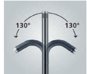
Precise motion for perfect control