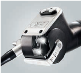
Integrated LED for optimal operating expense