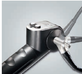
Ergonomic design for effortless use