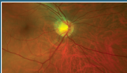
Pre-Treatment: Laser Vitreolysis