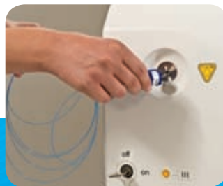
Intelligent fiber identification technology