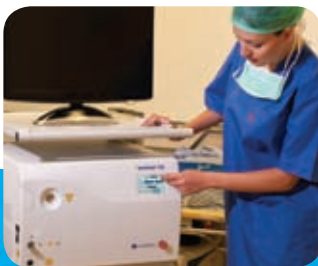
Flexible treatment settings

The VersaPulse P20 has integrated intelligent fiber identification technology. This technology enables the system to detect which Lumenis fiber has been connected and automatically brings up last settings used. These reusable and single-use fibers are custom designed to work seamlessly with the VersaPulse family and are perfectly suited for procedures such as tumors and stones.