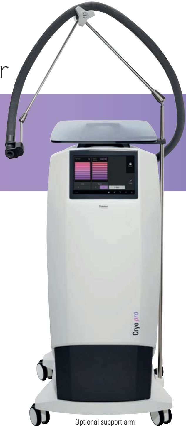
Optional support arm Description valid for the Cryo 7 variant

With its UV module, the new Cryo pro minimises germs in the cold air. It also features an improved air filter which already ensures significantly fewer particles in the aspirated air. As a result, the new cryotherapy device significantly improves hygiene during each laser application.